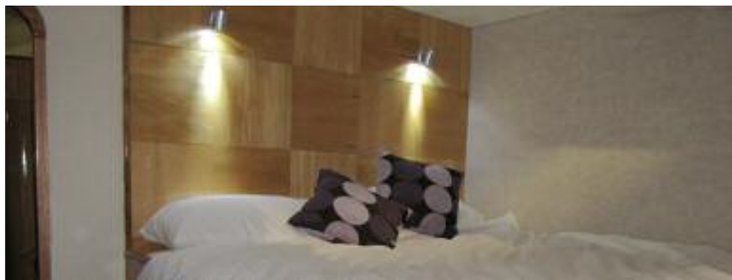
Left: Forward Berth