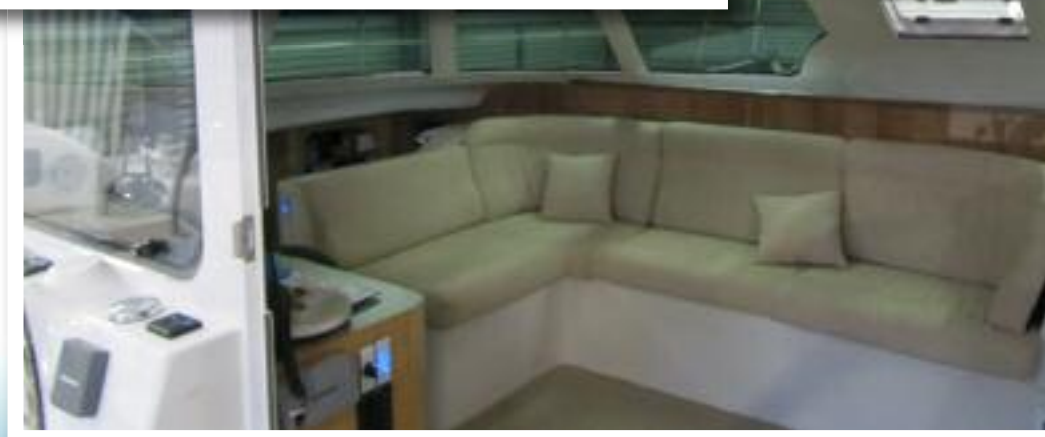
Right: Saloon Setee